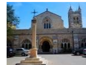
A Prayer for St George's Cathedral, our sister church in Jerusalem

We have an area in the Lady Chapel (to your right, blue carpet area) where young children are welcome under supervision. Toys/craft are provided.