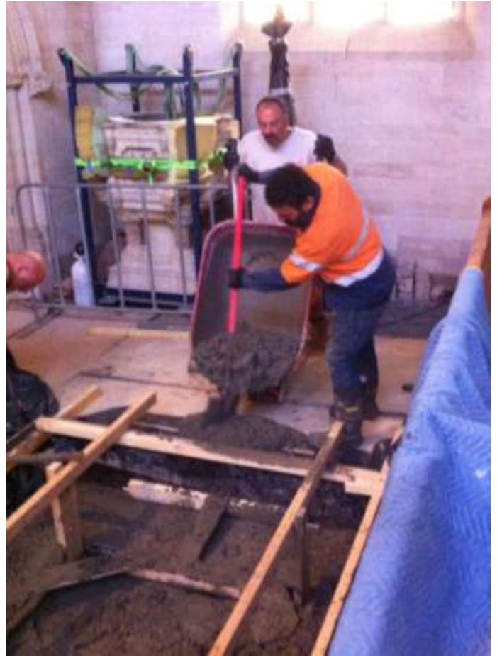
Concrete is poured for the font base