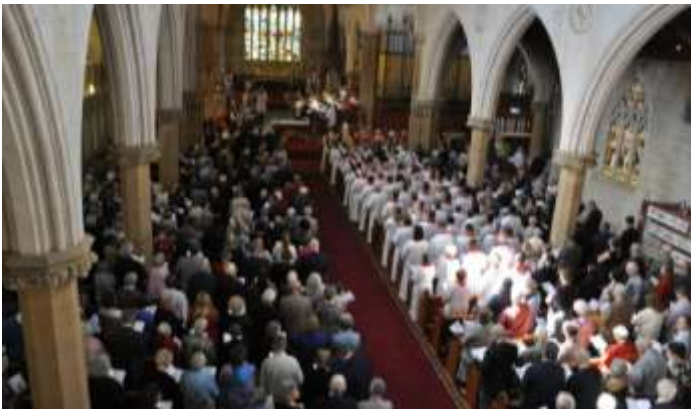
The congregation from the west gallery