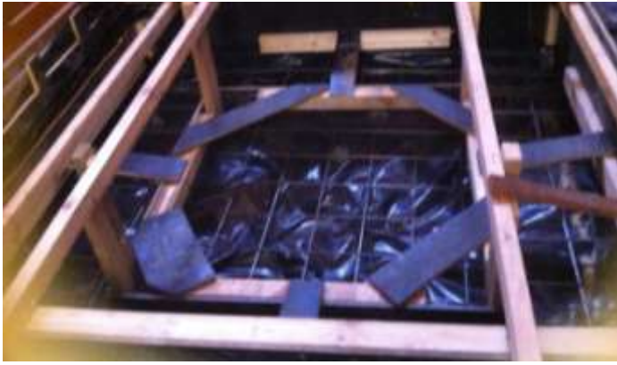
Waterproof membrane 900mm deep waiting for concrete to be poured for the new font base