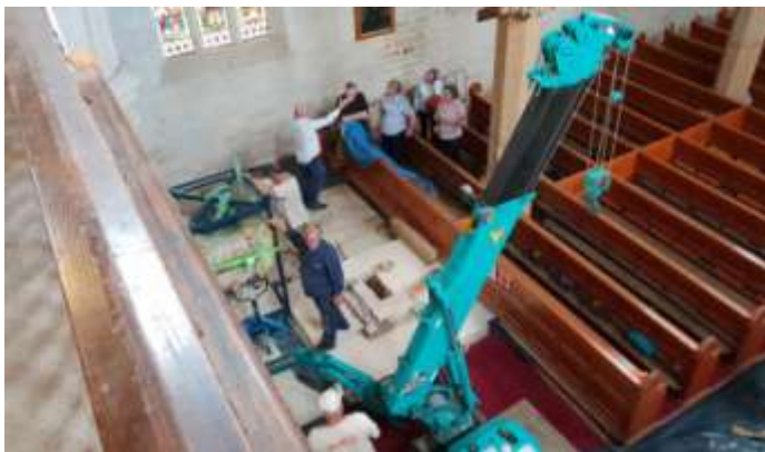
Everyone shared a feeling of relief after the font was removed undamaged.