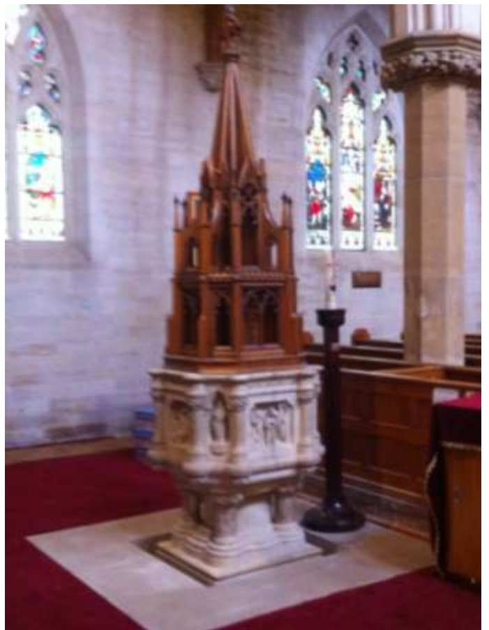
Restored font is now damp free, on ground level and more functional! It was blessed by Bishop Mark on Easter Sunday.