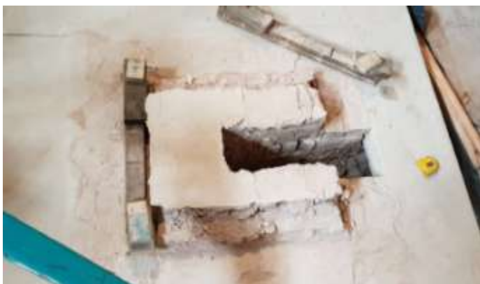
The cut away foundation where the font had stood.