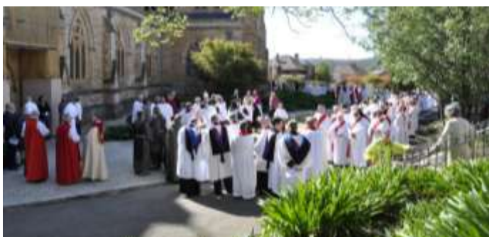
Clergy waiting to process into the Cathedral prior to the service