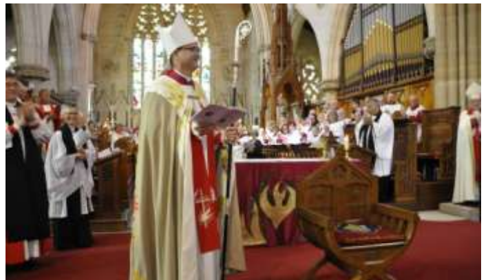
Greeting the congregation after the consecration