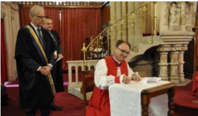
Signing the assent to the constitution and canons watched by the Chancellor and Registrar