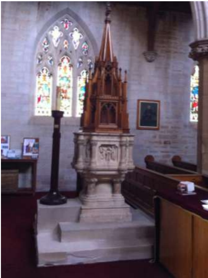
In the past the baptising priest would balance on the top step holding a baby on one arm and baptising with the other.