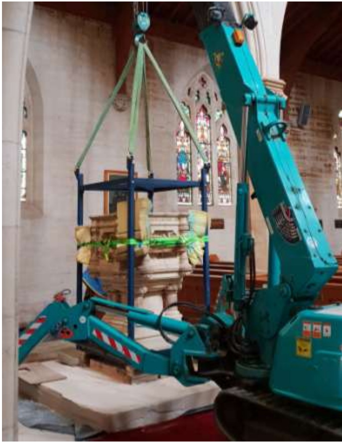
Font being lifted with a specially made frame around it and with lugs going underneath.