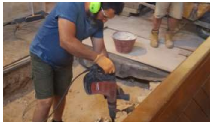
Removing the crumbling damp stone base.