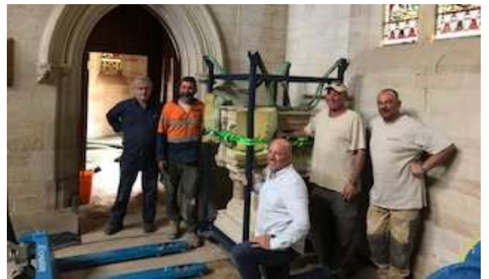
The lifting team stand proudly after font was relocated temporarily.