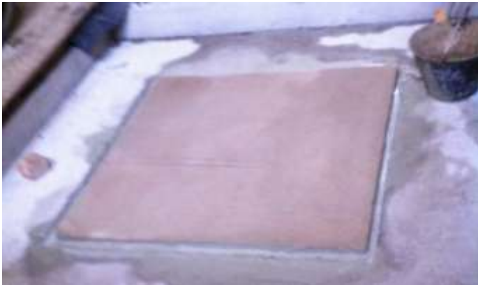
Sandstone base plate on top of concrete awaiting sandstone plinths to be placed around the edges